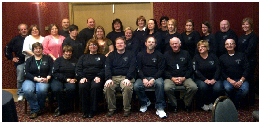
School reps, our Local Executive, and guests at the Rep Retreat